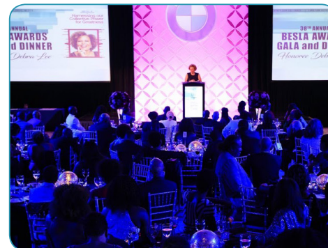
Gala & Awards Dinner