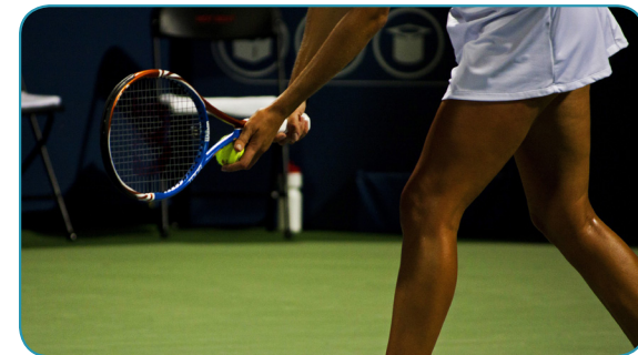
Women in Sports Initiative

Our sponsors determine the best way for them to partner with BESLA and maximize the benefits received.