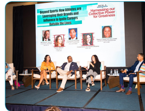
10 or More CLE Panels